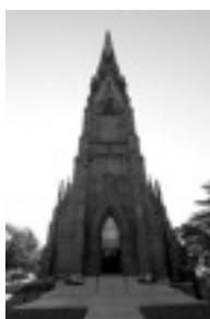
Cathedral of the Incarnation